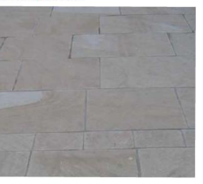
Potential to use the same high quality paving in the garden adjacent to 2-6 Cannon Street and in the garden beside the Abbey to connect the gardens across Distaff Lane