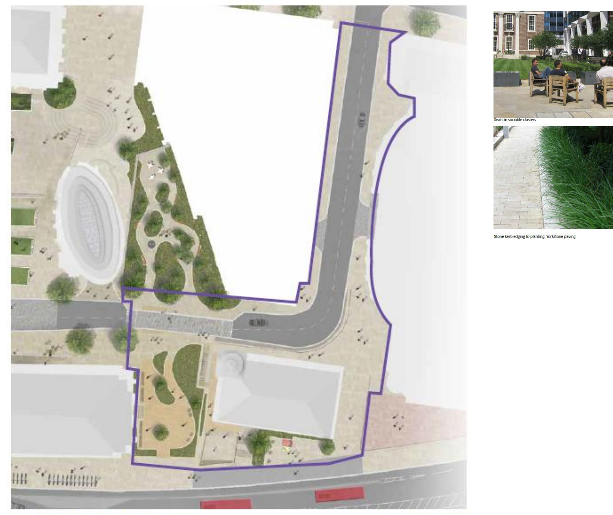
Area Studied For The Off-site Public Realm Works

Figure 2 – Showing the extent of off-site landscape proposals.