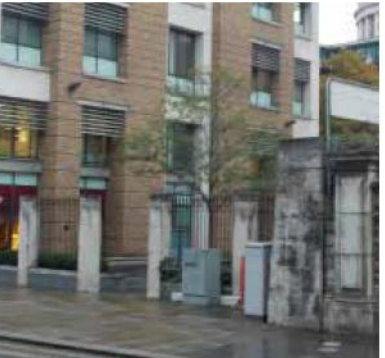
boundary to be retained